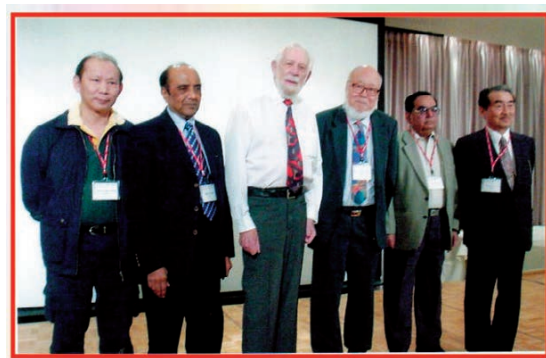
Officers of 1 st WFSLMS in Tokyo (2005)