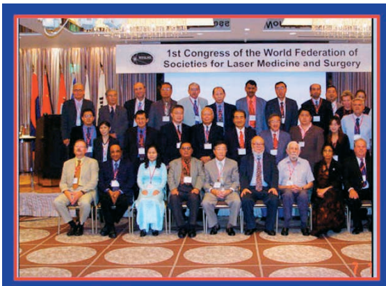
1 st Congress of World Federation of Societies for Laser Medicine and Surgery in Tokyo (WFSLMS 2005)